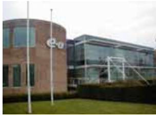
The modern main entrance/reception building