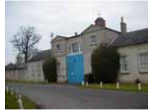
The stables building