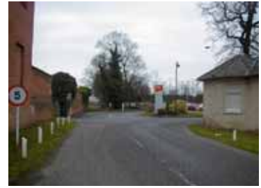
Walled garden and tower with the entrance to the staff car park to right, footpath and potential site linkage point in the middle distance

The land to the west of the existing employment site is approximately 3.3 hectares in size and is currently laid to grass. There is evidence of horticultural activity on the site. The site is relatively flat and level and surrounded by a mixed hedge and trees, providing some concealment of the site.