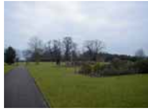
Part of the landscaped gardens with the football pitch and Church beyond