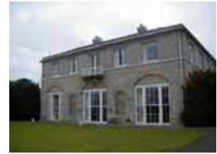
The east front of the historic Wherstead Park House

The site is relatively flat and level with trees to the north and a mixed tall evergreen/deciduous hedge to the south running along the lane to the Church. The offices are located in landscaped gardens and parkland, with mature trees and hedges in a rural location.