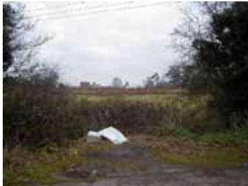
Overview of new allocation site looking east, with walled garden in background