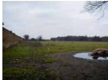
Northern area looking west with walled garden to left and junction of A137 and A14 just beyond the trees