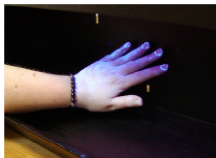
hands after washing