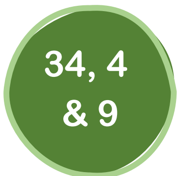
Different Officers, Cabinet Members and Witnesses attending