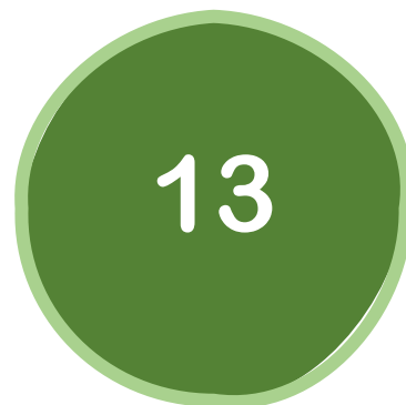
Recommendations to Cabinet/Council