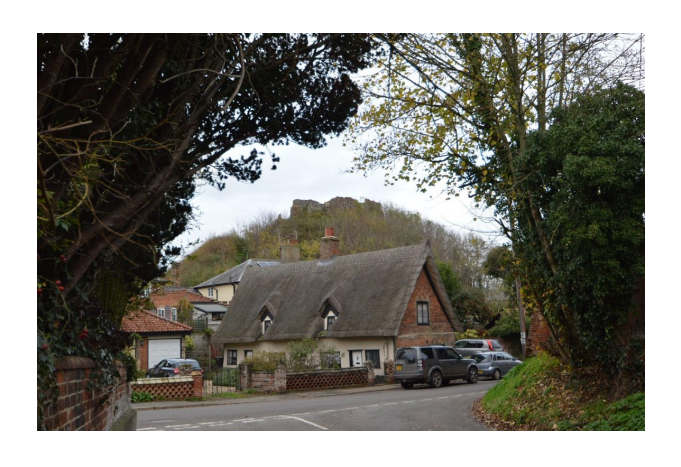
Form of View: Short or Long, unfolding, glimpsed, channelled or wide open

The type of view is also important, whether it is glimpsed between houses, or channelled down by streets. Buildings can align streets to frame the view which is seen along the line of the street. Open spaces and green spaces can be placed to allow a view out between the buildings, or can take advantage of slopes to allow views over the tops of buildings. Important vistas normally have an object stopping the view, with the longer the vista the more important the building is likely to be. Views down both long and short street should not be terminated by garages, parking, storage, service entrances, backs of building or substations.