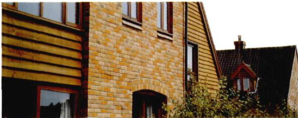
The Individual dwelling...