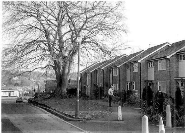
... but it's setting