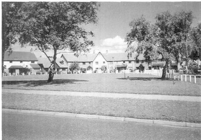
"First comes the shape of the development"