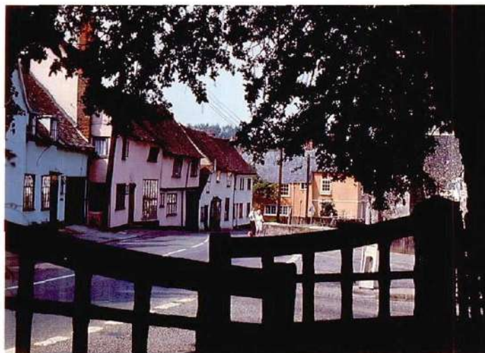
"Unique character of Suffolk ..."