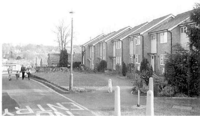
"Not so much the house itself..."