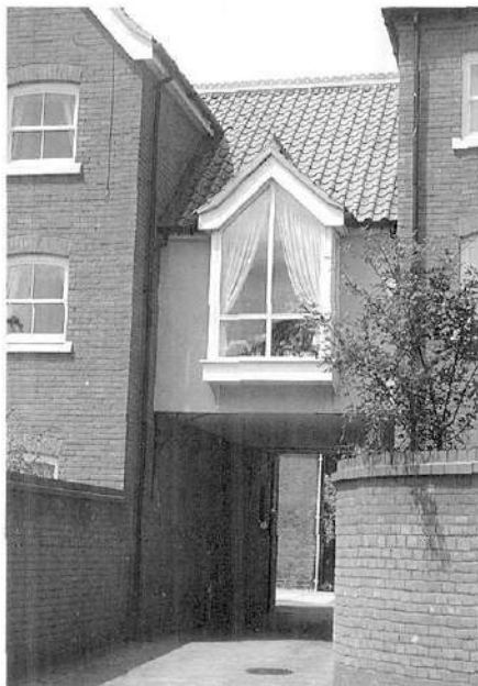
"Second comes the choice of materials and details...."