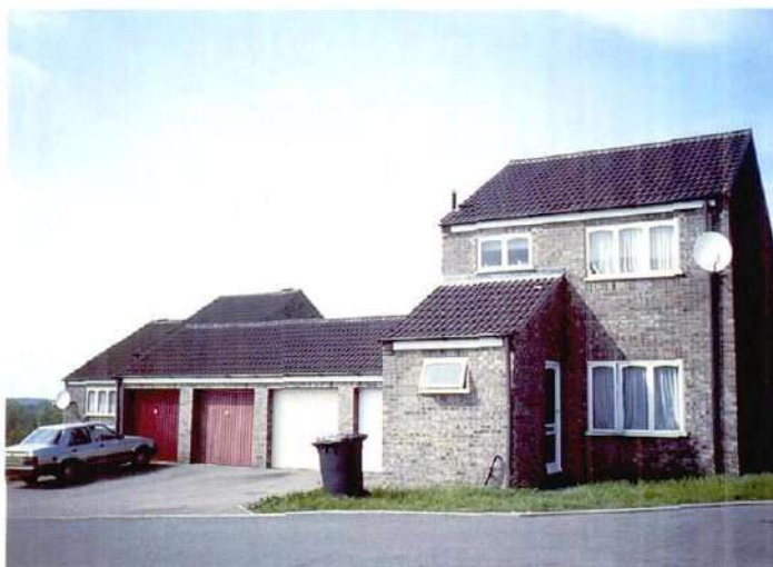
"... totally nondescript..."