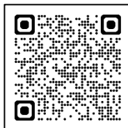
link to view Conservation Area Appraisal