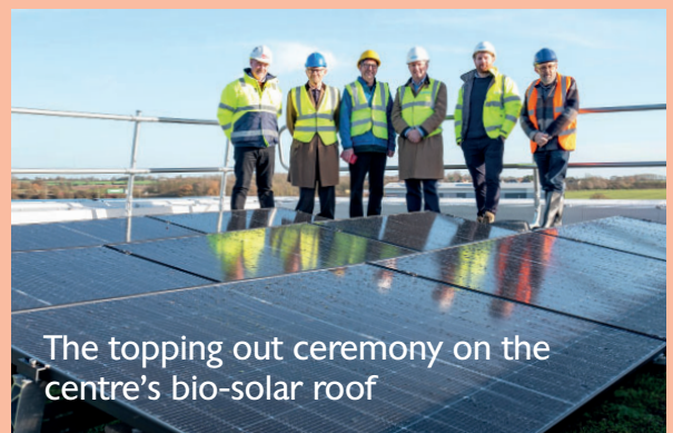
The topping out ceremony on the centre's bio-solar roof

For more details about the £18million development –